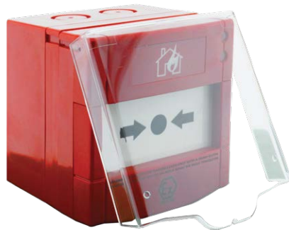
ML-2730.IS Maxlogic Conventional Manual Call Point, Resettable, Weatherproof (IP65), Intrinsically Safe