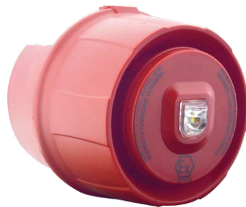
ML-2490.IS Maxlogic Conventional Sounder & Beacon, Weatherproof (IP65), Intrinsically Safe