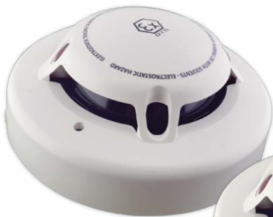
ML-2110.IS Maxlogic Conventional System Photoelectric Smoke Detector, Intrinsically Safe

Specially designed for high-risk areas where ATEX certification is required and precise, stable detection performance is crucial. The ML-21XX.IS series fire detectors, featuring easy installation and user-friendly, ergonomic design, ensure maximum protection.