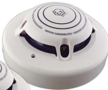
ML-2140.IS Maxlogic Conventional System Multisensor (Photoelectric Smoke + Heat) Detector, Intrinsically Safe