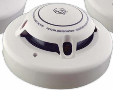
ML-2130.IS Maxlogic Conventional System A1R Rate of Rise Heat Detector, Intrinsically Safe