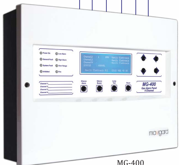
MG-400 Gas Alarm Control Panel, 4 Channel

ML-2730.IS Maxlogic Conventional Manual Call Point, Resettable, Weatherproof (IP65), Intrinsically Safe