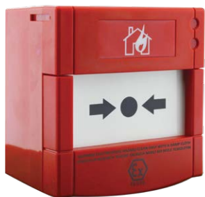
ML-2710.IS Maxlogic Conventional Manual Call Point, Resettable, Intrinsically Safe

Specially designed for high-risk areas where ATEX certification is required, with an emphasis on precise and stable detection performance. The ML-27X0.IS series call points, featuring easy installation and user-friendly, ergonomic design, are preferred for their compatibility with all conventional fire alarm systems.