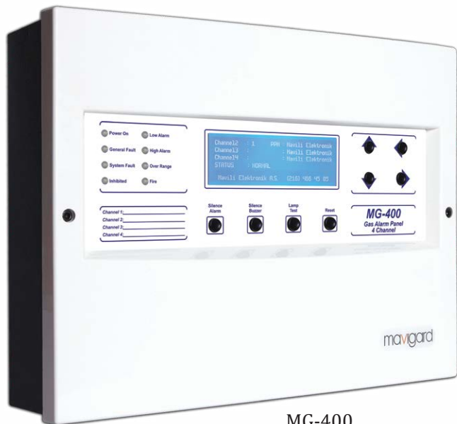
MG-400 Mavigard Gas Alarm Control Panel, 4 Channel

The modern design panel, offering advanced programmability and high performance with its 4 channels, is widely applicable for industrial use. Panels offer many features to integrate to automations applications.